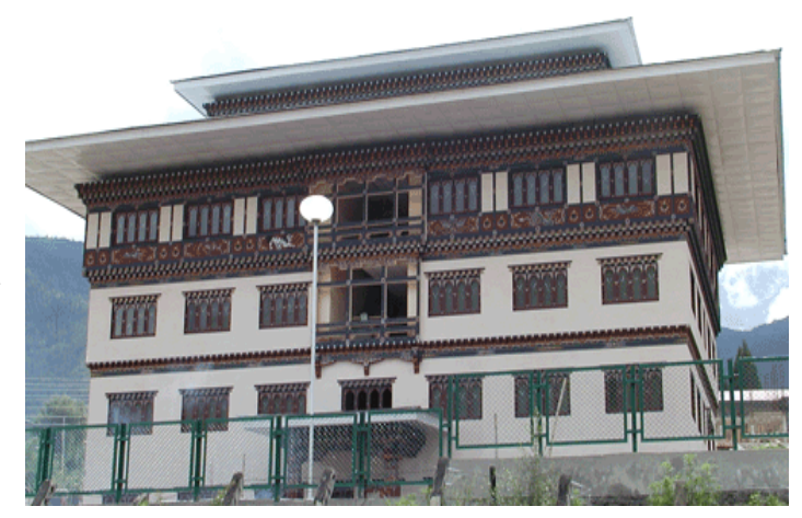
The Bhutan Integrity House, Kawangjangsa, Thimphu

committee of Accounts and Audit in response to the need for establishing accountability. Committee comprise of one representative the King and one representative each from the Cabinet, People and the Monk Body all nominated by the King. The Royal Government issued the first edition of the "Financial Manual" in 1963. The manual provided for the organization of the Wing Development of the government and the Accounts