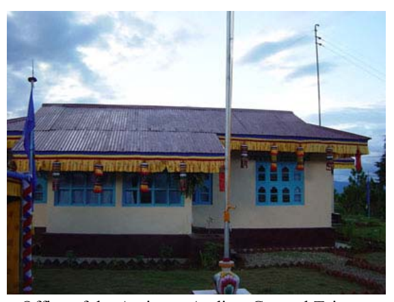
Office of the Assistant Auditor General, Tsirang Established: 26<sup>th</sup> July 2003