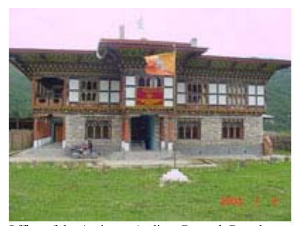
Office of the Assistant Auditor General, Bumthang Established: 11<sup>th</sup> November 2002

A good audit service must be supported by an appropriate organizational structure that translates its mandate and facilitates operational responsiveness to the demands of the national accountability goals. The Royal Audit Authority at present has two departments viz: Department of Sectoral Audit (DSA) and Department of Performance, Thematic and Technical Audit (DPTTA) each headed by an Assistant Auditor General. Proposals to restructure the organization of the RAA have been approved by the government. Accordingly, the RAA had already opened up one branch office in Bumthang on 11th November 2002 and very recently on 26th July 2003 another branch office in Tsirang was inaugurated.